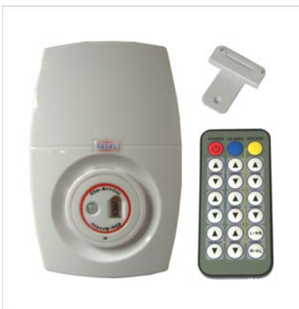
Part No. Description CSA-FGS Combined Flame, Smoke & SpeechPO CSA-IR2 Infra-Red Remote Controller