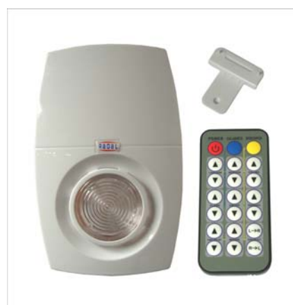
Part No. Description CSA-FSU Combined Voice Sounder & Beacon CSA-IR2 Infra-Red Remote Controller